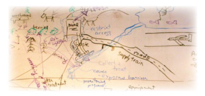
Participant-generated diagram of typical mine site risks.