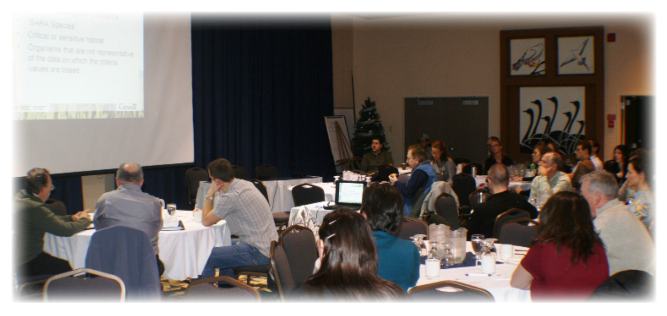
Day 1 at the Risk Assessment Information Session.