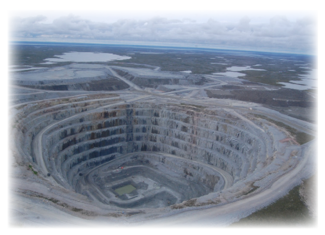
Ekati Diamond Mine, NWT

BHP Billiton Canada Inc. (BHP) and Diavik Diamond Mine Inc. (DDMI) have type A water licences (administered by the Wek'èezhìi Land and Water Board (WLWB) that allow them to construct, operate, and close their respective mines. For the first time in the history of the Northwest Territories, two operating mines completed the approval process for their closure and reclamation plans in collaboration with the stakeholders of the Mackenzie Valley.