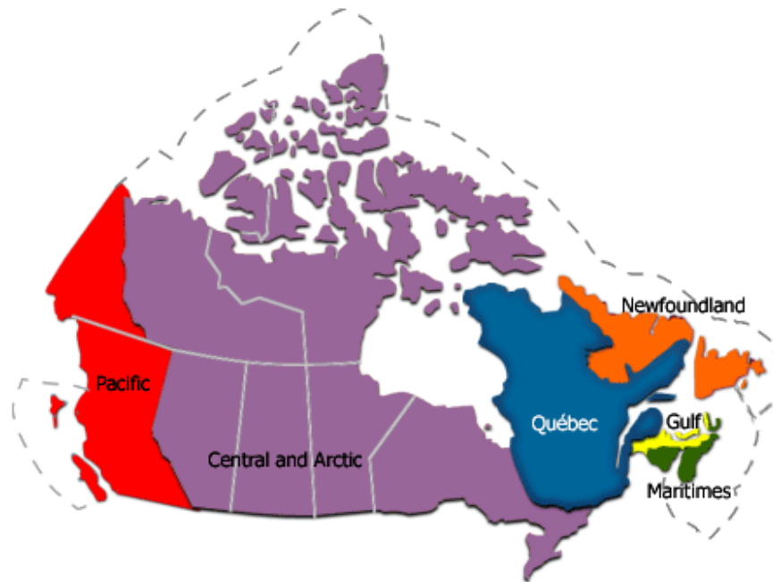
Figure 1: Map of the various DFO Regions in Canada.