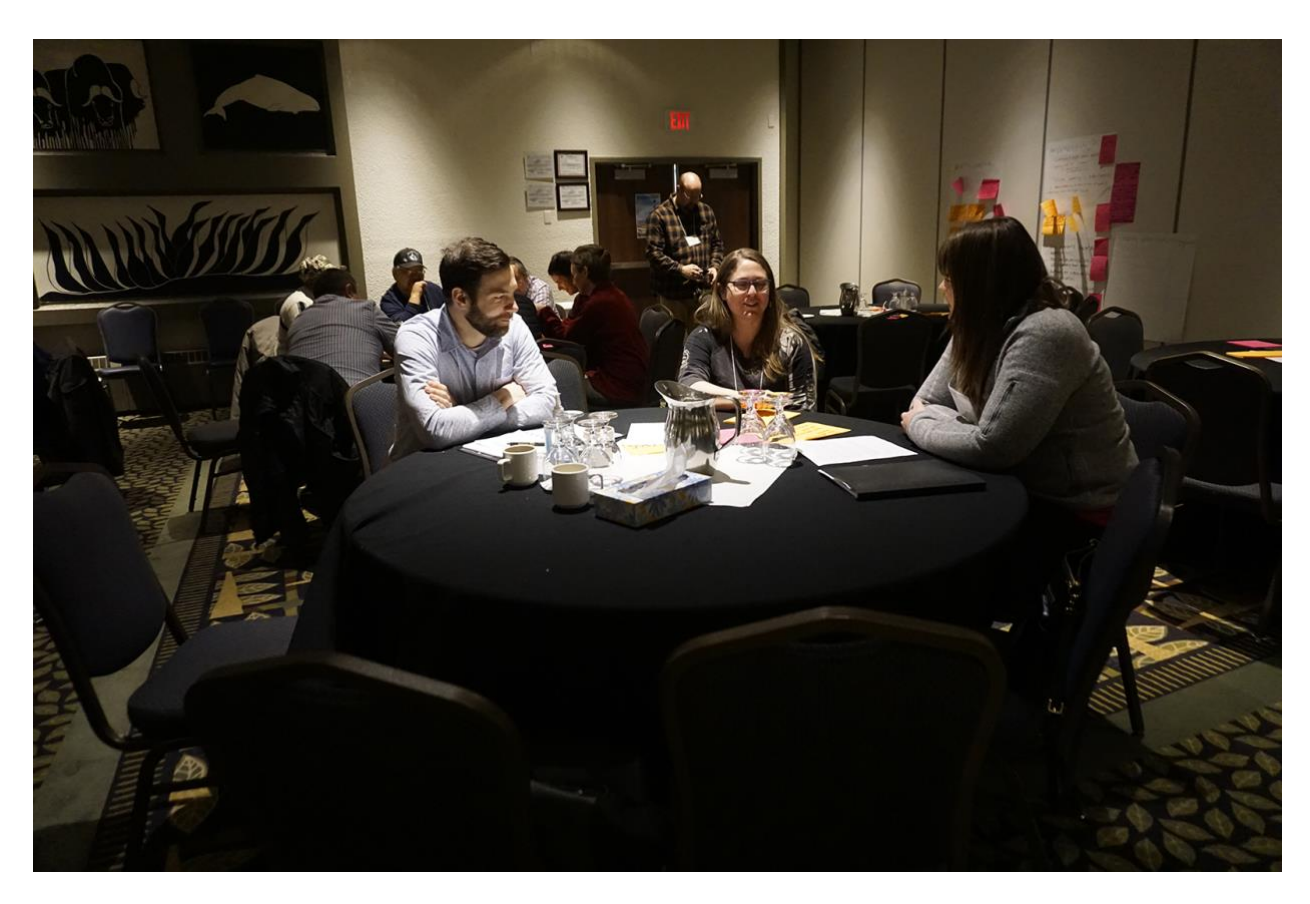
Workshop participants discussed engagement in small groups.