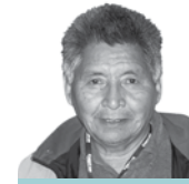
GEORGE BARNABY FORT GOOD HOPE Reappointed December 2007.